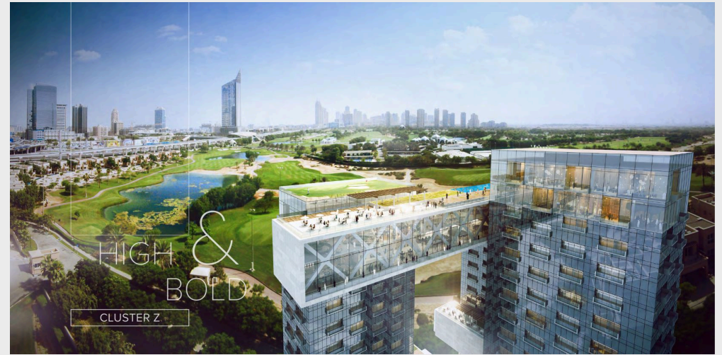
Cluster Z Dubai, UAE ■ bridged towers with environment-reactive facade