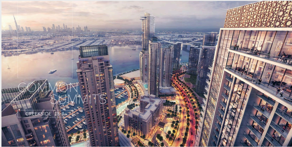
Creekside 18-A Dubai Creek Harbour, UAE ■ twin residential towers in the new district