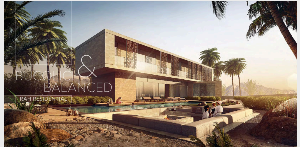
RAH Residential UAE ■ site-specific strategy across 6 typologies