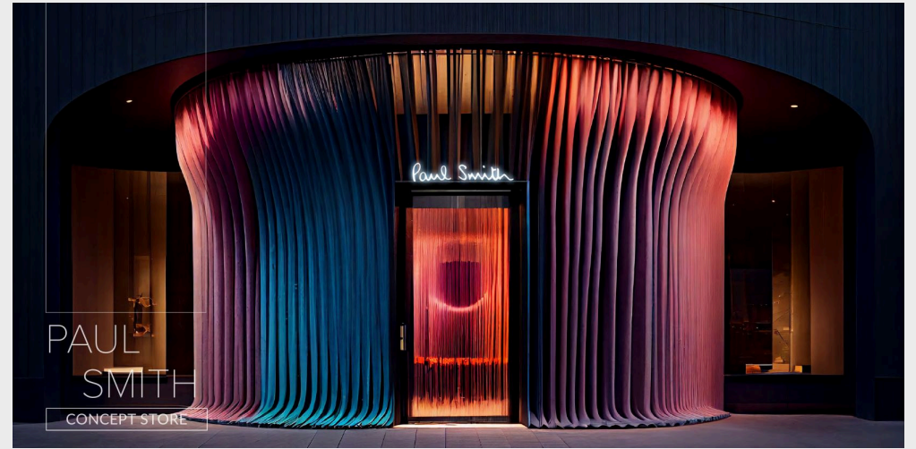
Paul Smith Concept Store Retail ■ brand aesthetics infused into every architectural element