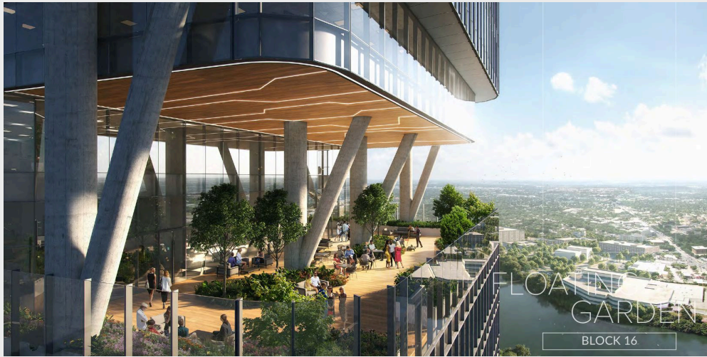
Block 16 Dubai, UAE ■ workplace tower with hanging garden amenity levels