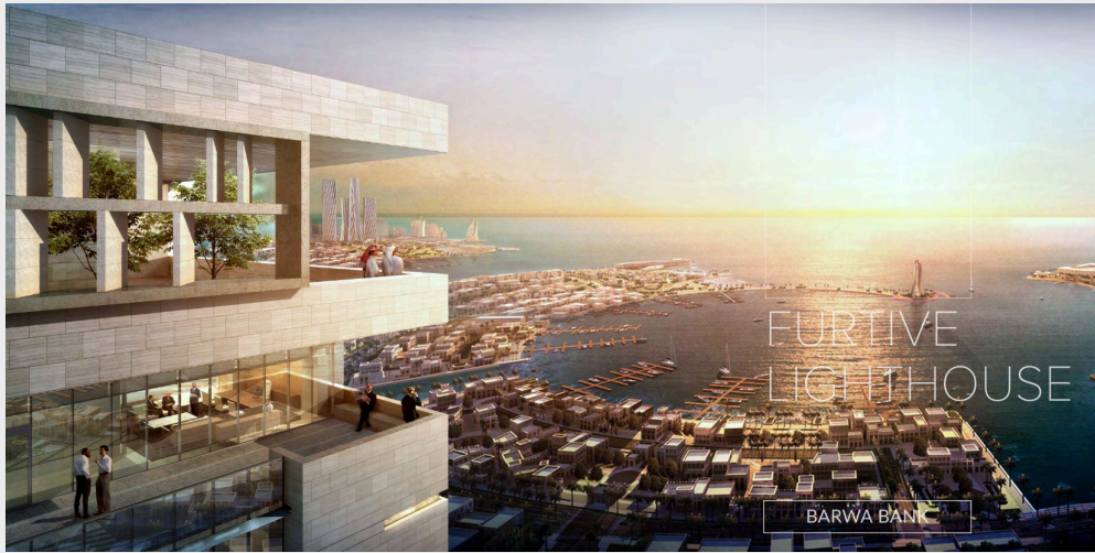
Barwa Bank HQ Lusail, Qatar ■ flagship headquarters with autonomous louvered facade