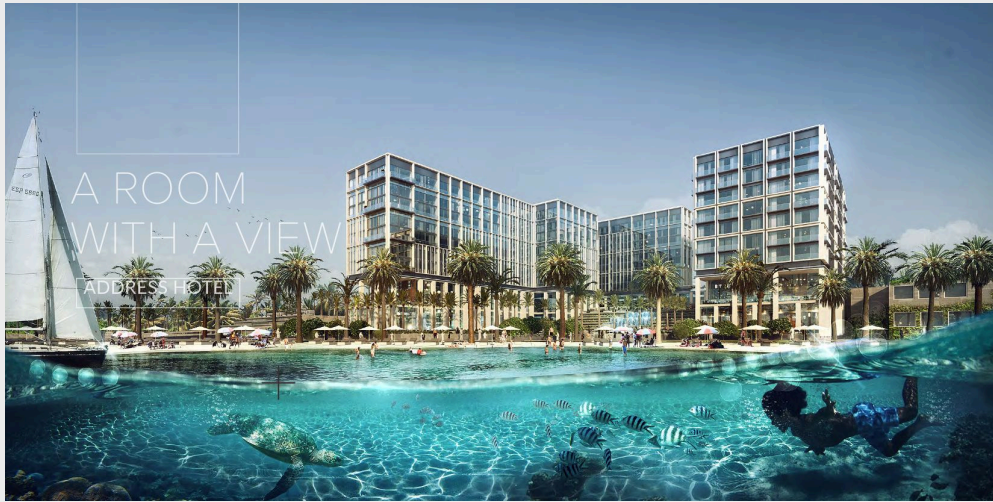
Address Hotel Marassi, Bahrain ■ hotel and serviced apartments, modular sea-view facade